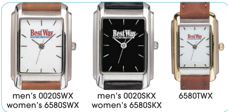
men's 0020SWX women's 6580SWX